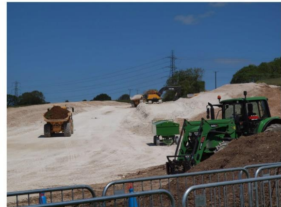
Great Missenden - Haul Road Construction

AN EXAMINATION OF THE HS2 BIODIVERSITY CALCULATIONS - PART 1