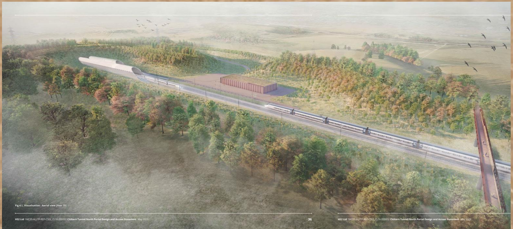
Fig 4.1. Visualisation - Aerial view (Year 15)