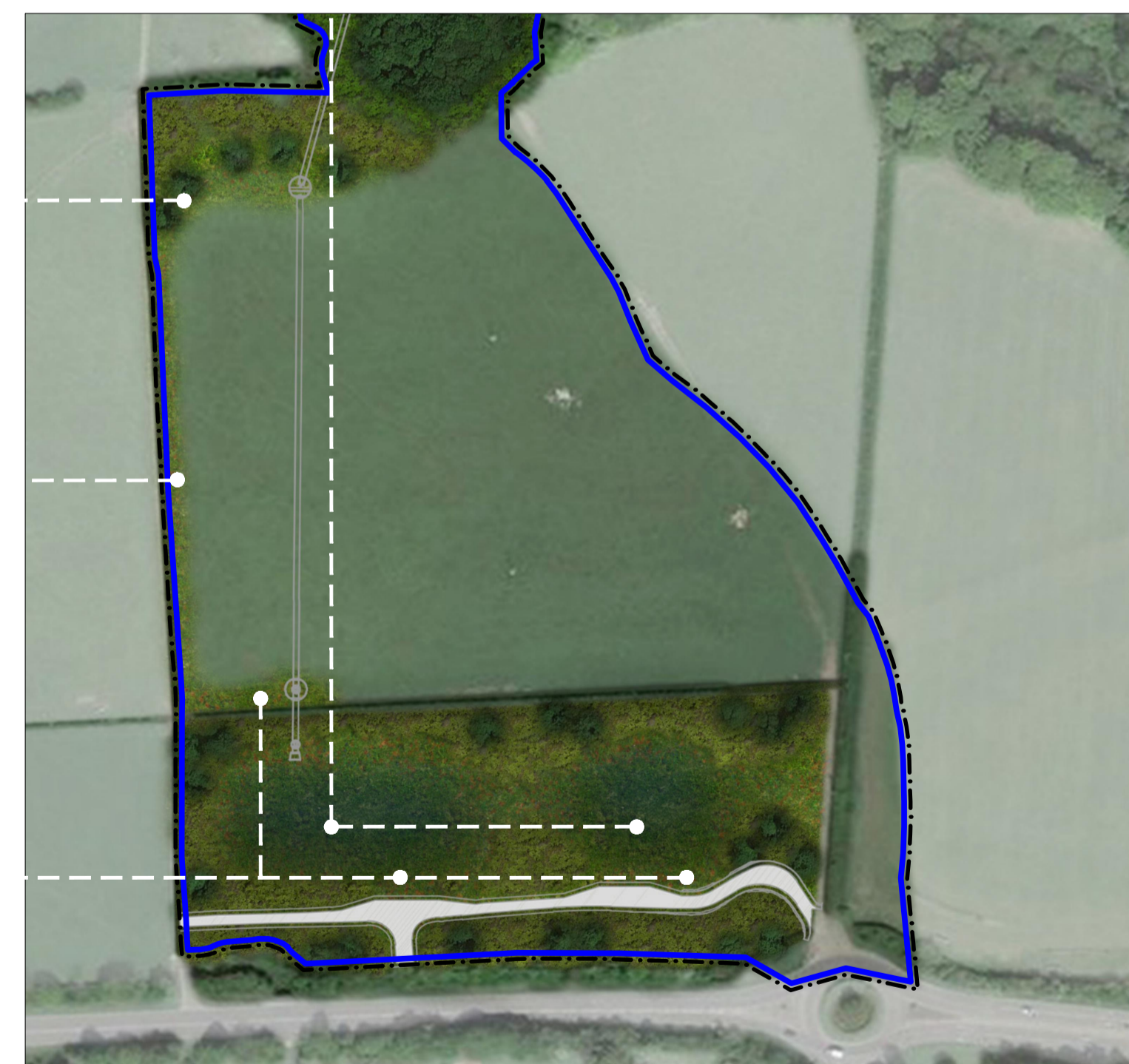
Inset Plan - 1 : 2000 @ A1