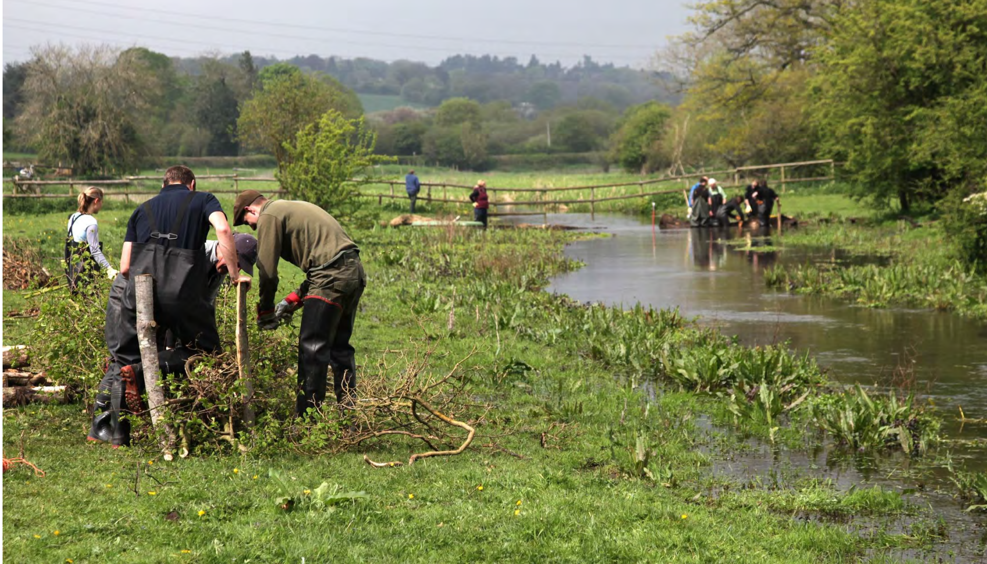
Restoring the R. Misbourne – volunteers, Little Missenden, 2014 A1190 (5)