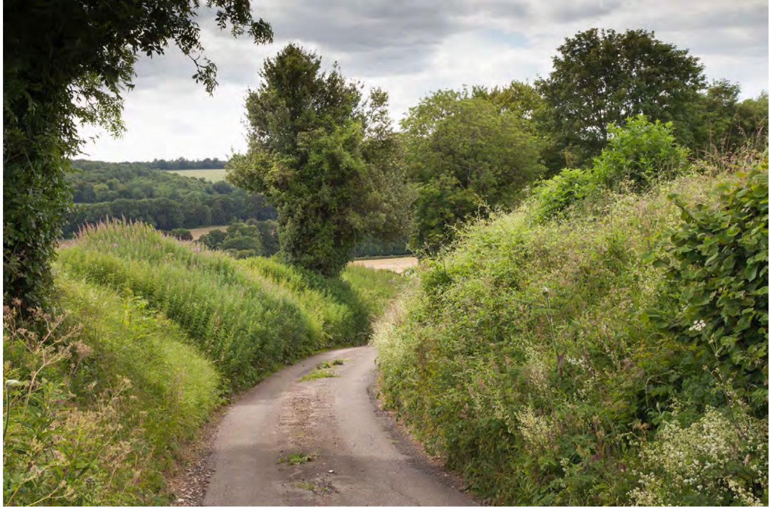
Bowood Lane, within construction footprint